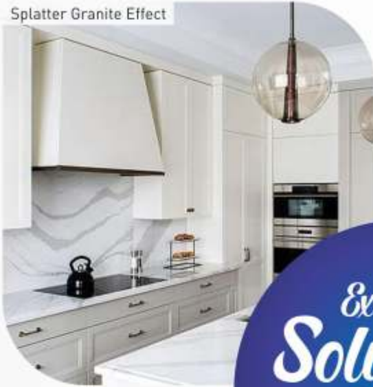
Splatter Granite Effect