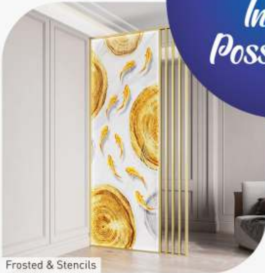
Frosted & Stencils

Excellent Solutions Infinite Possibilities